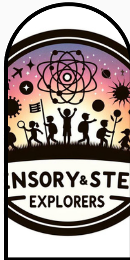
(5-12 Y/O) PLAYFUL EXPLORATIONS: SENSORY & STEAM