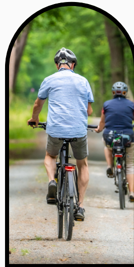
BIRDING BIKE TOUR