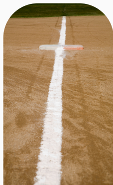
SUN, APR 7: PLAY PRIDE KICKBALL